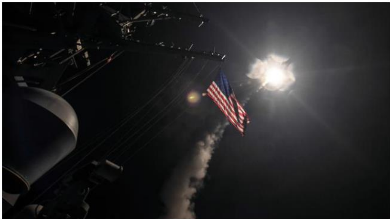
The USS Porter fires a Tomahawk missile from the Mediterranean in retaliation for a chemical attack on Syrian civilians on Tuesday